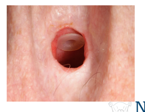
Image: TEP valve visible through the laryngectomy stoma, between the posterior wall of the trachea and the oesophagus behind.

These devices are often known as TEP (from the US spelling of 'esophagus'). They can be created at the time of primary surgery, or later. A puncture is made into the posterior portion of the trachea into the oesophagus behind. Exhaled air can be forced through this connection by the patient by covering their stoma in expiration. Air passes through the pharynx as above and oesophageal speech is possible. A one-way valve is usually placed into the puncture site to reduce the risk of contamination of the airways with GI contents. Some stoma covers incorporate an additional valve to direct air through the TEP valve without manual occlusion of the stoma, which makess hands-free speech. possible. TEP valves should not be removed in an emergency as they should not occlude the airway and removing them will not improve acute respiratory problems.